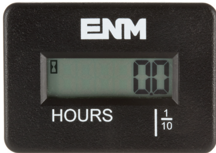
T44D65A 4.5-60 VDC/VAC 50/60 Hz T44D69A 115-275 VDC/VAC 50/60 Hz